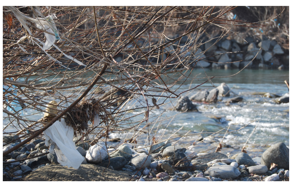
Discharges of waste water into water bodies

The report also lists some developments, some of which do reflect the current reality, such as: