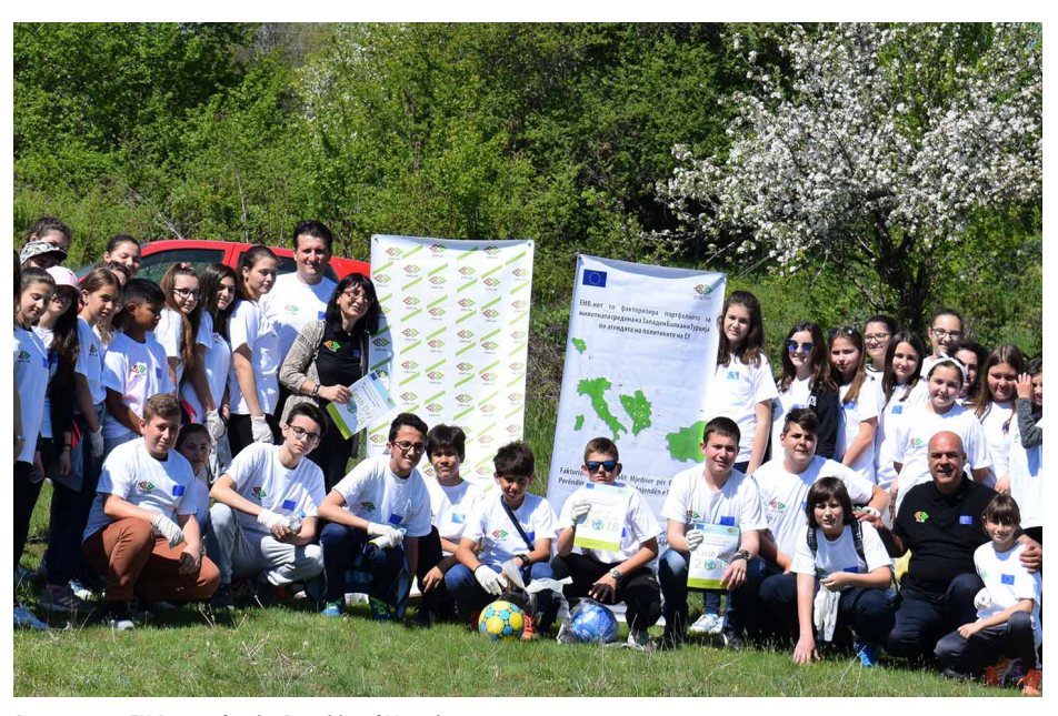
Source: 2018 EU Report for the Republic of Macedonia: https://ec.europa.eu/neighbourhood-enlargement/sites/near/files/20180417-the-former-yugoslav-republic-of-macedonia-report.pdf

- Accelerate implementation of the national strategy for transposing, implementing and enforcing of the EU acquis on environment and climate change, especially in the waste and water sectors;