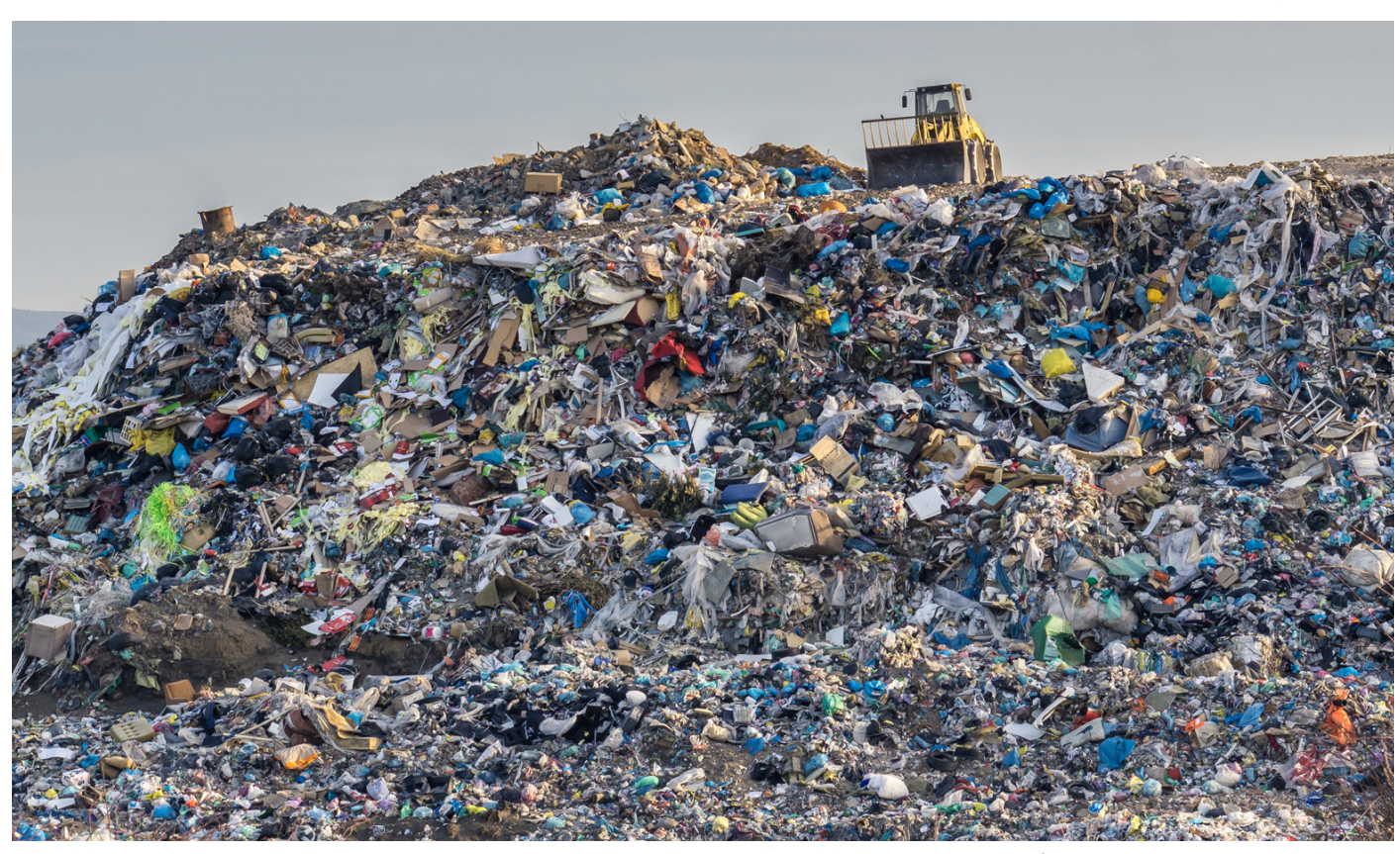
Figure 1: The three planned nuclear power plants in Turkey. While there are detailed agreements for Akkuyu and Sinop, the details for İğneada are yet to be disclosed.

among the most unsuccessful ones. Nearly every government since 1960s, regardless of their political stance (conservative or left-wing), has pursued the aspirations of building nuclear power plants, but failed to realise them due to financial constraints, lack of administrative or technical capacity, civil society opposition, or as some claim, due to the proliferation concerns of the western countries. Turkey seems to have overcome these problems by adopting BOO strategy through intergovernmental agreements with Russia and Japan. Although this strategy solves the