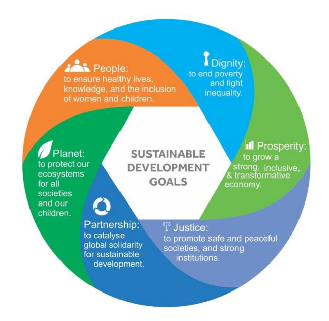
Dignity: to end poverty and fight inequalities

Figure 1. Six essential elements for delivering the SDGs